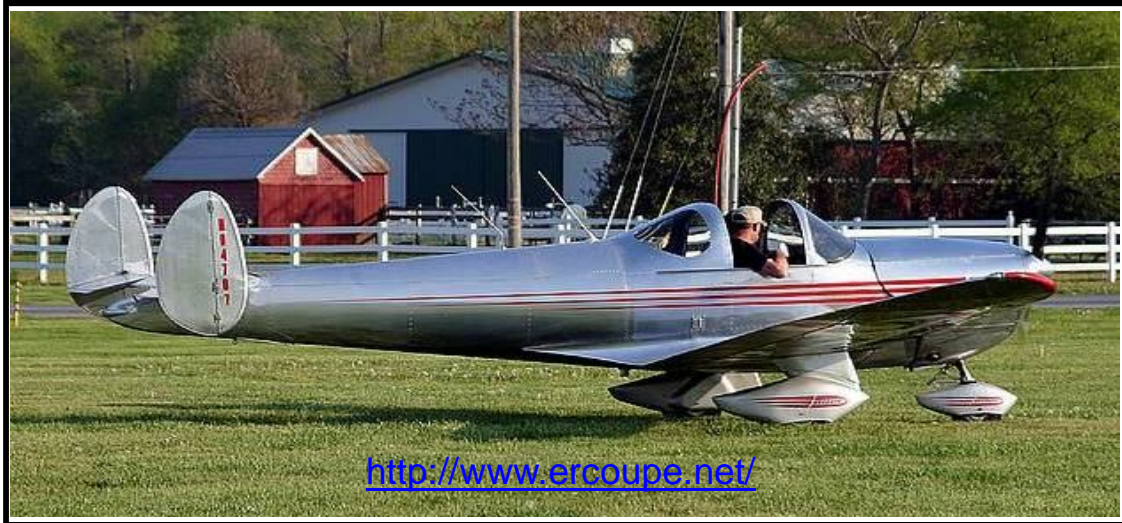
The Ercoupe Network

A Californian's e-Collection of all things Pietenpol http://www.westcoastpiet.com/