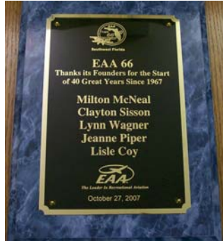
Thank You to EAA 66 Founders