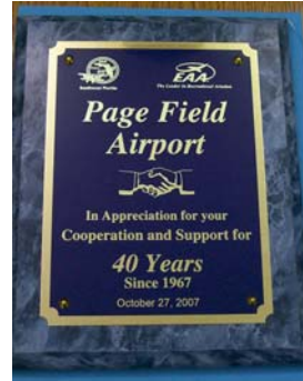
Page Field Airport Cooperation & Support