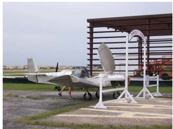
The first time anyone has seen our project in one piece.

If you have any trouble printing this newsletter, go to our web site and get it from the PDF archive.