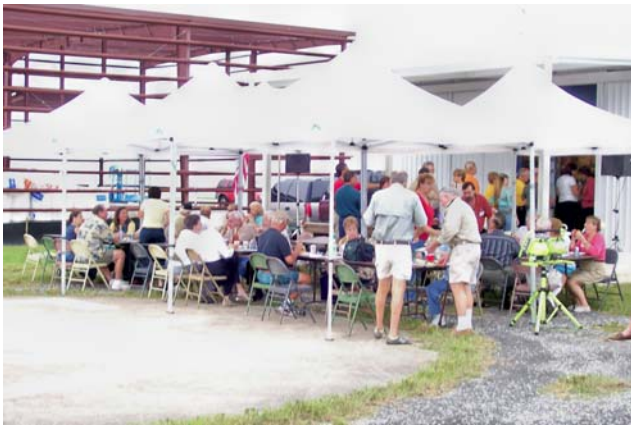
The crowd outside was only equaled by the crowd inside.